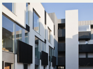
CEMETERY ROAD PROJECT ORANGE