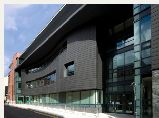
FURNIVAL BUILDING BOND BRYAN ARCHITECTS