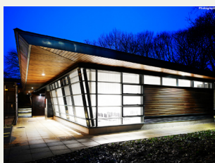
THE ARTHUR WILLIS ENVIRONMENTAL CENTRE, BOND BRYAN ARCHITECTS

YOU CAN ALSO VOTE FOR YOUR FAVOURITE BUILDING IN THE PEOPLES AWARD AT WWW.SHEFFIELDCIVICTRUST. ORG.UK/DESIGNAWARD