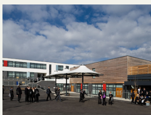
NEWFIELD & TALBOT SCHOOL HML ARCHITECTS