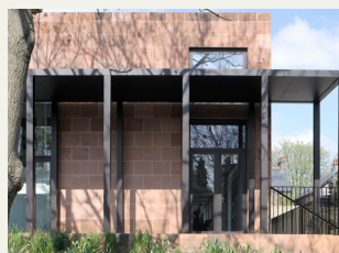
THE WORKSHOP DRDH ARCHITECTS